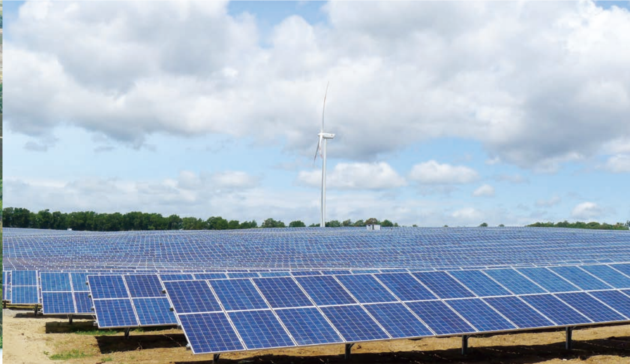
2 MW Southern France Project Type: Ground Mount Utility