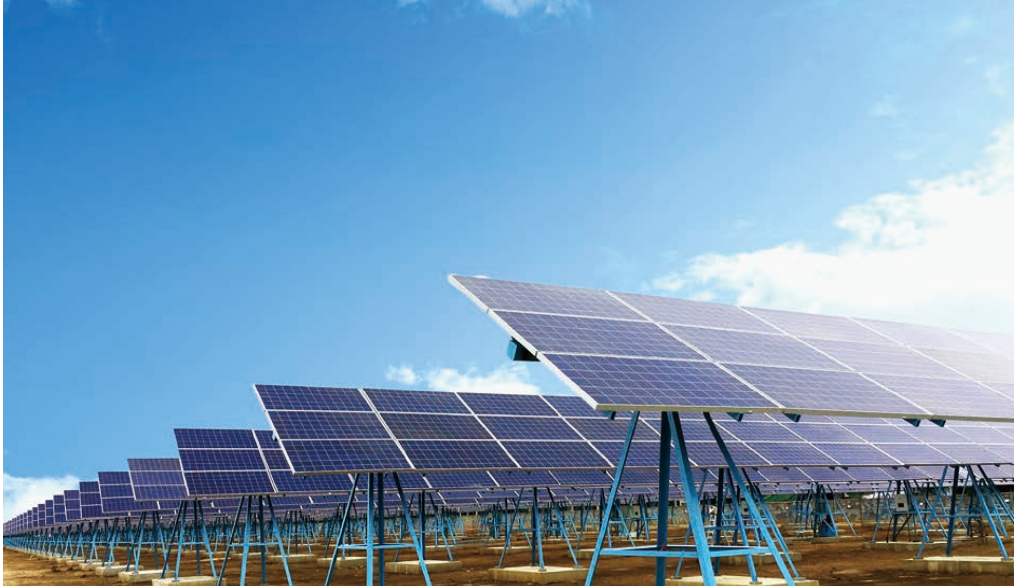
1.75 MW Bangkok, Thailand Project Type: Ground Mount Solar Farm