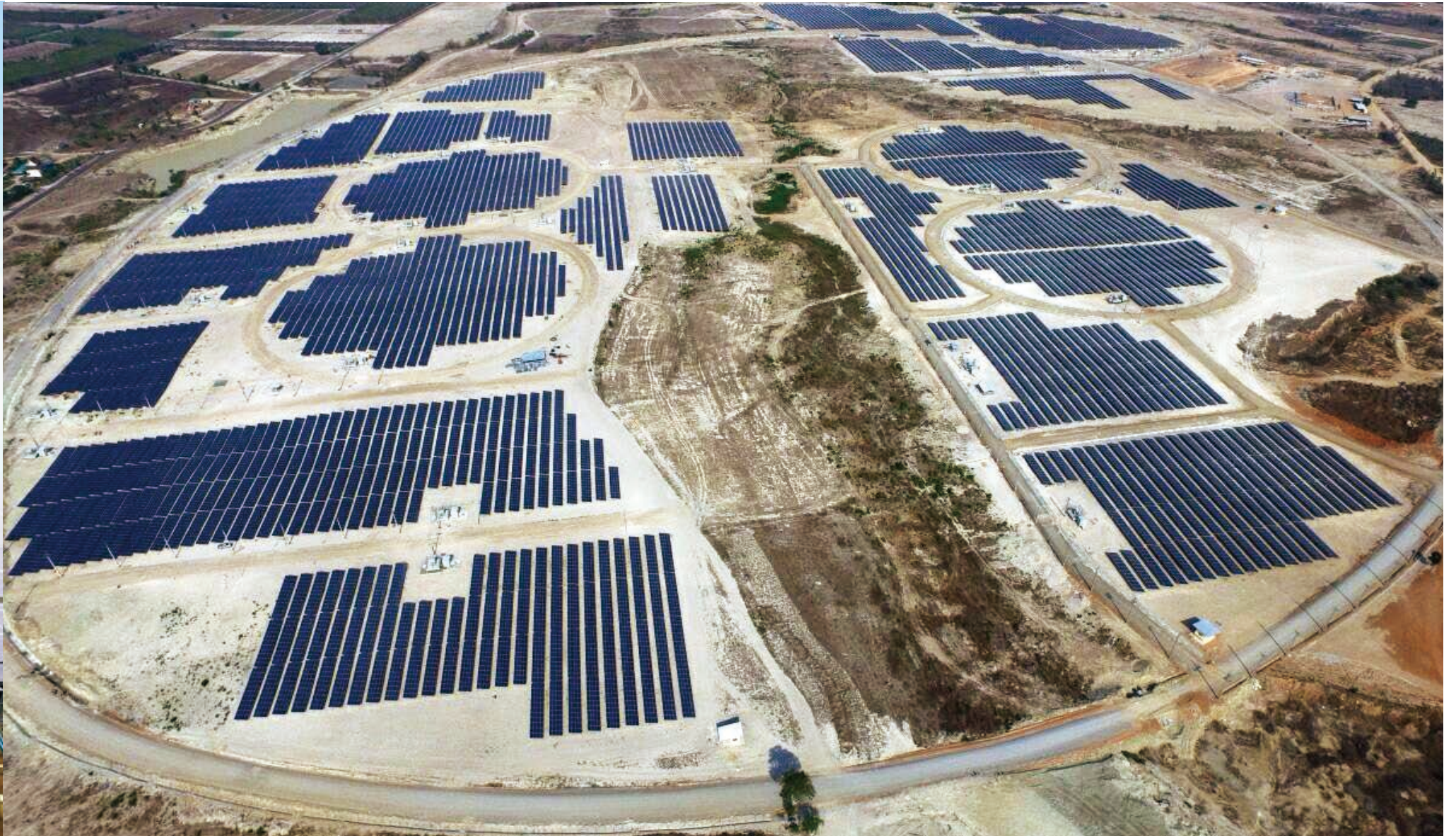
Cha-Am, Thailand Project Type: Ground Mount Utility 15 MW