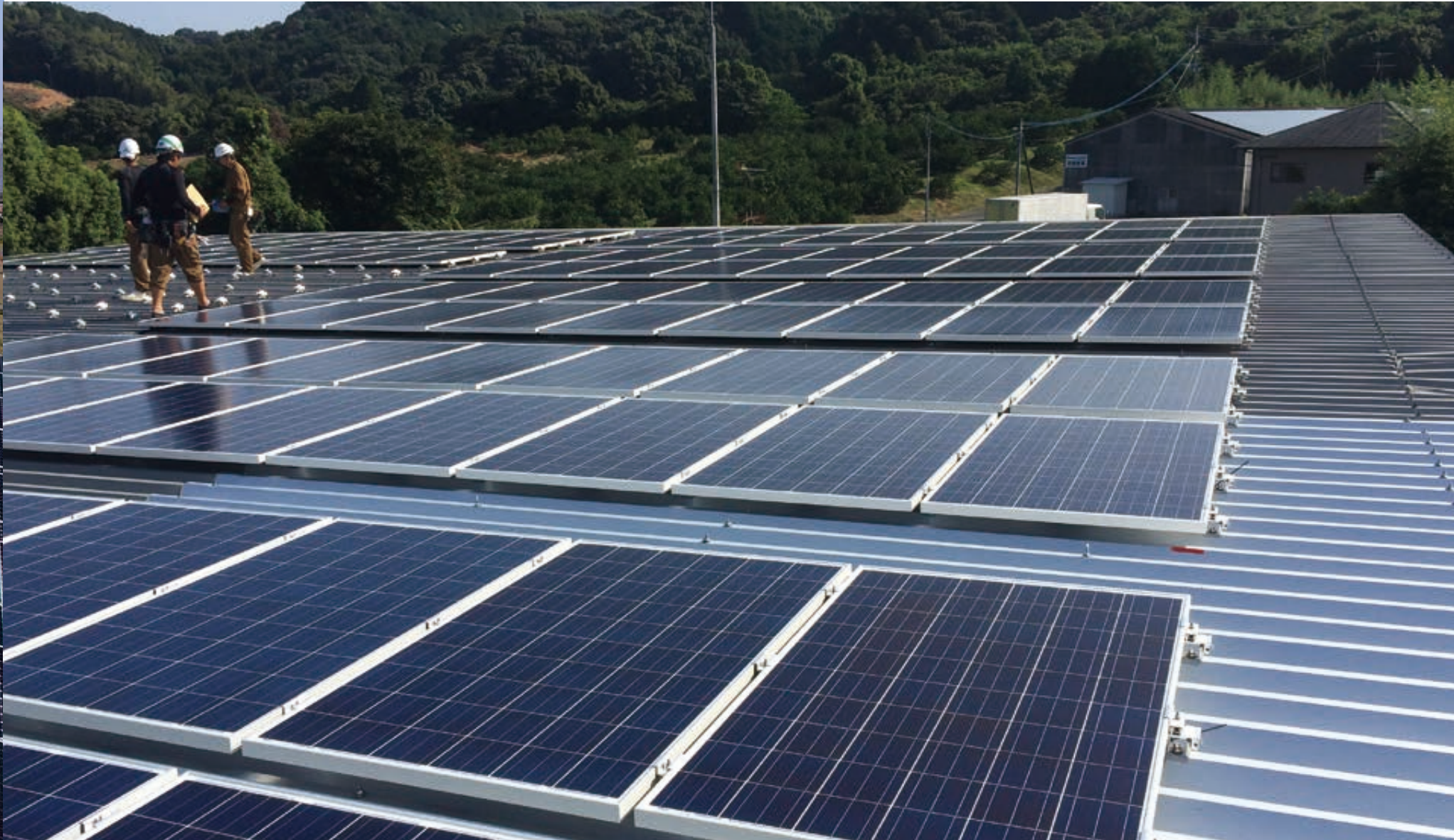
274.2 kW Gifu, Japan Project Type: Ground Mount Solar Farm