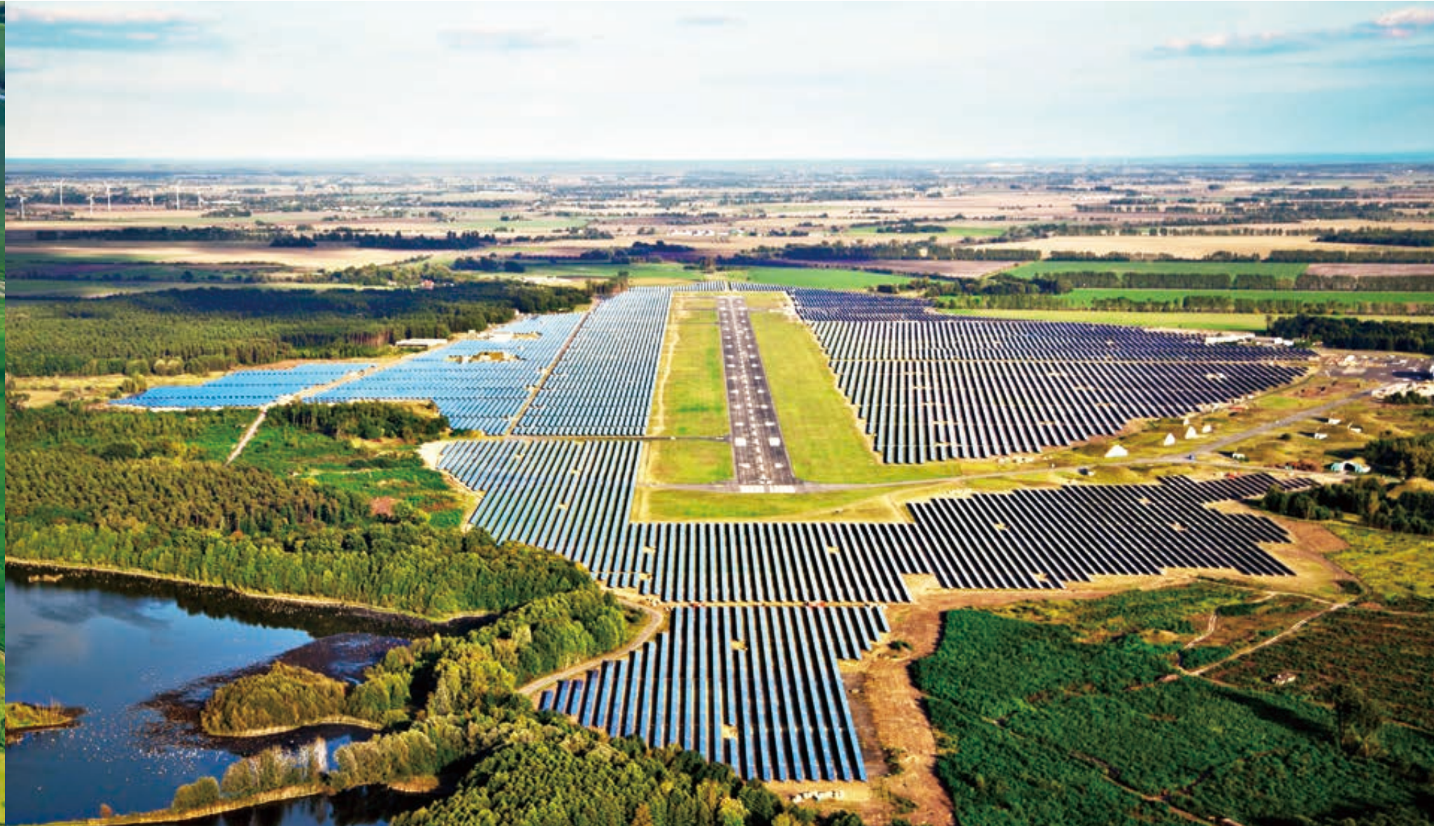
13 MW Lincolnshire, UK Project Type: Ground Mount Utility